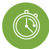
Time & Attendance Union Wage & Benefit Rates and Prevailing Wage Rates