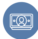
Payroll, Tax, Union Fringes, Certified Payroll Reporting