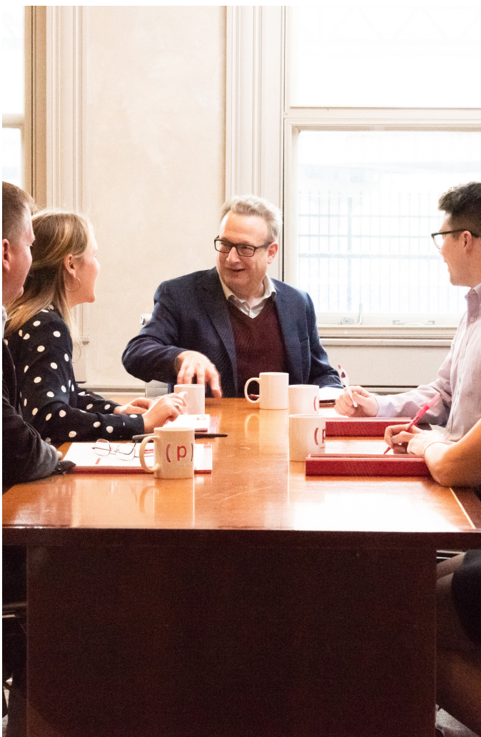
Propark's management team gains key strategic insights into its operations – insights that fuel better decision making.

"In the old system, there was no way to create consolidated financial statements," he says. "It was a painful, manual process for us and as soon as we were done, the reports were out of date. In Sage Intacct, consolidated financials are available instantly as a standard report option — we just choose what we want from the menu. It has completely eliminated a 10 to 12-hour task for our team each month."